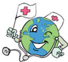
World Health Day

April 7, World Health Day: In 1948, the WHO held the First World Health Assembly. The Assembly decided to celebrate 7 April of each year, with effect from 1950, as the World Health Day. The organisation sees the World Health Day as an opportunity to draw worldwide attention to a subject of major importance to global health each year.