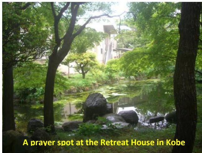
A prayer spot at the Retreat House in Kobe