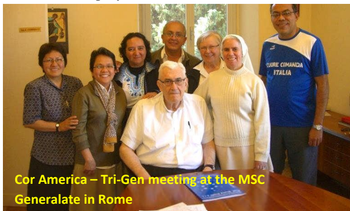
Cor America – Tri-Gen meeting at the MSC Generalate in Rome