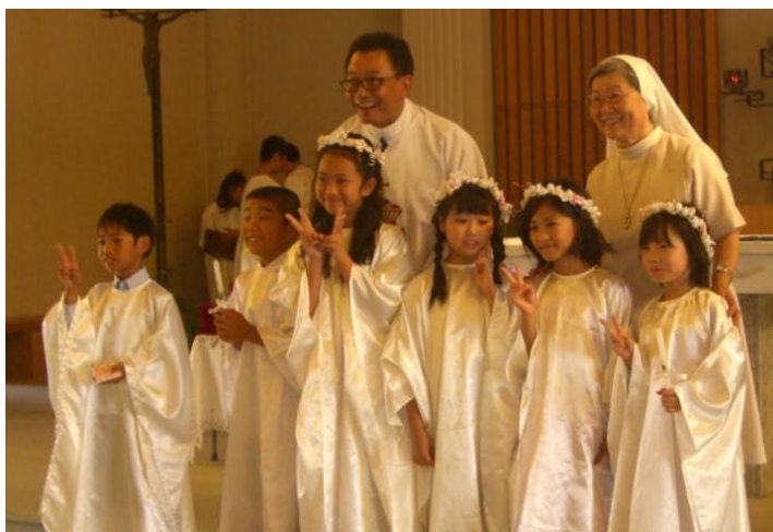
The first communicants in Johokobashi

On the morning of the 15 th , the sisters renewed their vows during the Eucharistic celebration. The rest of the day was reserved for the community meeting which was a follow-up to the October 2014 canonical visitation. This annual visit to the Japan community ended with a sumptuous Japanese meal. As we continue to discern and work on the future of our Japan community, the Generalate has committed itself to visiting the community annually. Let us continue to include the Japan mission and its future in our prayers.