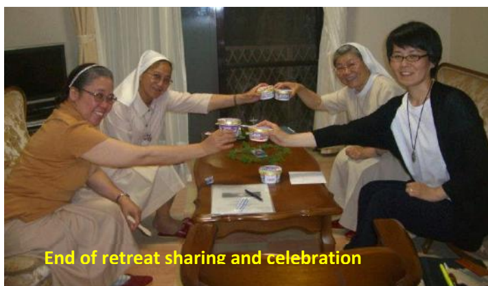
End of retreat sharing and celebration