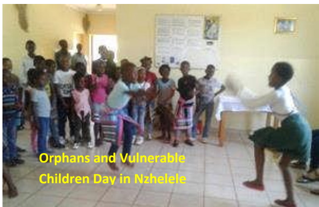
Orphans and Vulnerable Children Day in Nzhelele

Since my stay was during the lead-up to Christmas, there were a number of special activities scheduled and I was fortunate to be able to attend some of them.