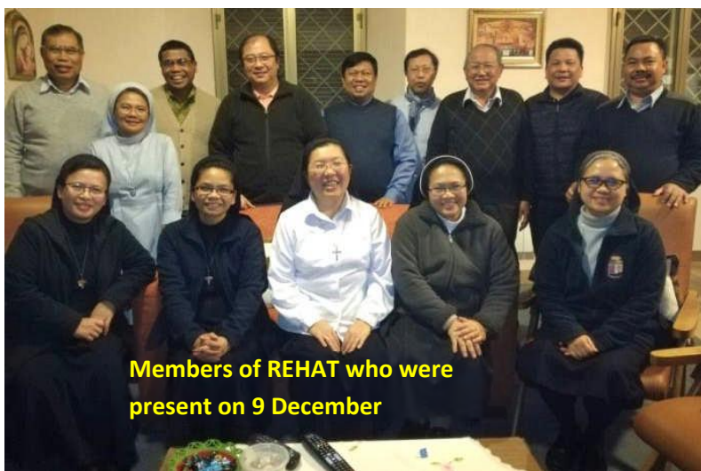
Members of REHAT who were present on 9 December