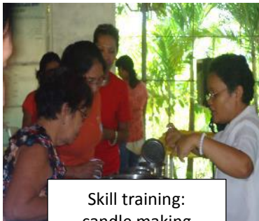
Skill training: candle making