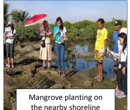
Mangrove planting on the nearby shoreline