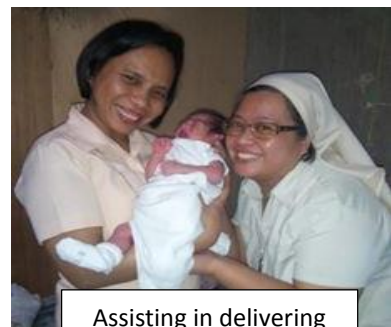
Assisting in delivering a baby