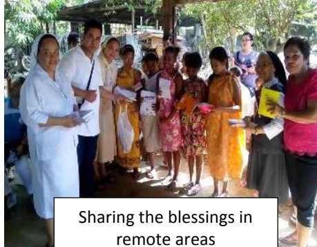
Sharing the blessings in remote areas