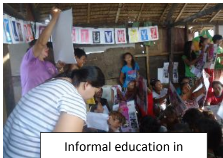
Informal education in Badjao community