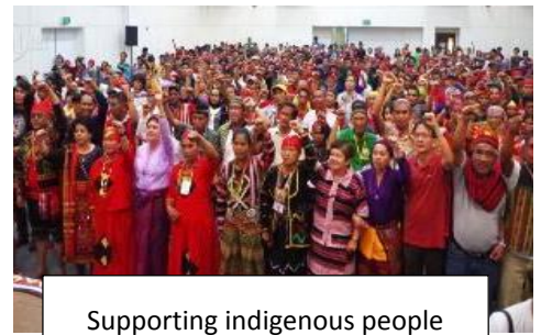
Supporting indigenous people

In all our ministries our goal is to move from “I” to “we”, and to care together for what Pope Francis calls “our Common Home”! Therefore we pray :