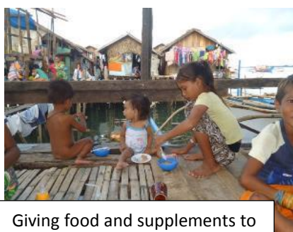
Giving food and supplements to malnourished children