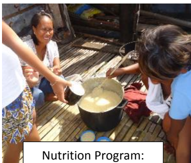
Nutrition Program: sharing a meal