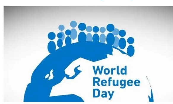
June 20, World Refugee Day: this event honours the courage, strength and determination

of women, men and children who are forced to flee their homeland under the threat of persecution, conflict and violence.